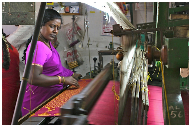
WaterCredit clients and their families benefit in many ways, including increased time for income-generating activities.

Information regarding MFI partnership criteria is available upon request and on the WaterCredit website, http://watercredit.org .