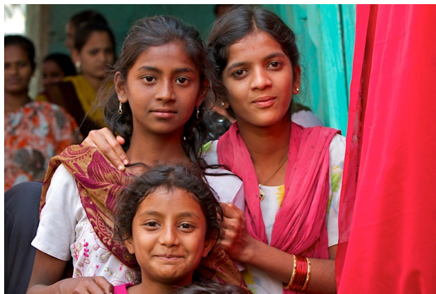
WaterCredit learnings in India hold promise for others.