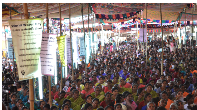
World Water Day Celebrated in Tamil Nadu, India. Water.org is committed to promoting WaterCredit research, learning, and knowledge dissemination, and seeks to generate a movement – and spur opportunities for microfinance, water and sanitation innovation – that extends far beyond the organization itself.

Content currently on the WaterCredit website includes information about how WaterCredit works, WaterCredit Forums and other cross-sector workshops, dynamic mapping features, and a variety of papers and reports focused on microfinance for water and sanitation. In the future, Water.org may develop a password-protected site for WaterCredit partner organizations to connect directly with Water.org and others in the WaterCredit network. Together, these offerings serve the overarching goals of the WaterCredit learning platform to provide insight and guidance to those organizations that wish to launch their own loan portfolios focused on water- and sanitation-related products and services, both now and in the future.