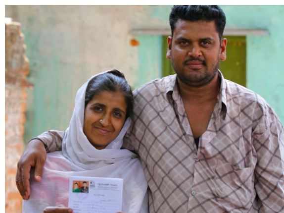
Above, WaterCredit clients proudly present their loan documents. Below, the loan disbursement process takes place at the offices of a WaterCredit partner in India.