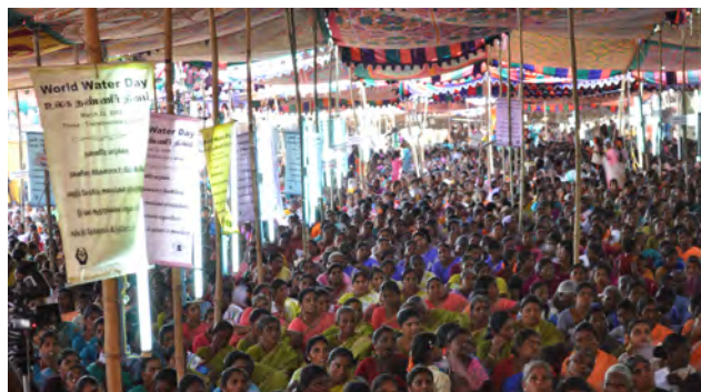
World Water Day Celebrated in Tamil Nadu, India. Water.org is committed to promoting WaterCredit research, learning, and knowledge dissemination, and seeks to generate a movement – and spur opportunities for microfinance, water and sanitation innovation – that extends far beyond the organization itself.

Content currently on the WaterCredit website includes information about how WaterCredit works, WaterCredit Forums and other cross-sector workshops, dynamic mapping features, and a variety of papers and reports focused on microfinance for water and sanitation. In the future, Water.org may develop a password-protected site for WaterCredit partner organizations to connect directly with Water.org and others in the WaterCredit network. Together, these offerings serve the overarching goals of the WaterCredit learning platform to provide insight and guidance to those organizations that wish to launch their own loan portfolios focused on water- and sanitation-related products and services, both now and in the future.