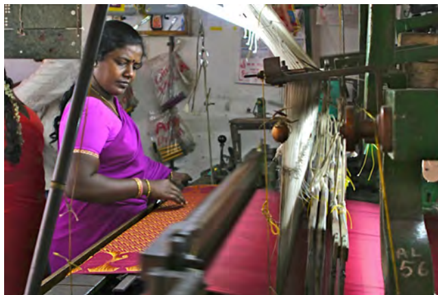
WaterCredit clients and their families benefit in many ways, including increased time for income-generating activities.

Information regarding MFI partnership criteria is available upon request and on the WaterCredit website, http://watercredit.org .