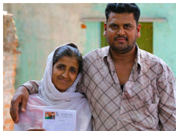
Above, WaterCredit clients proudly present their loan documents. Below, the loan disbursement process for new water and sanitation connections takes place at the offices of a WaterCredit partner in India.